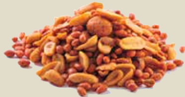
■ MEDITERRANEAN MIX – A MIX OF SUNFLOWER SEEDS AND PEANUTS WITH A MILDLY SPICY COATING