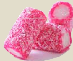
■ COCONUT SNACK-PINK OPTIONALY IN VARIED COLORS