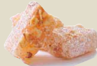
■ TURKISH DELIGHT WITH ALMONDS/PISTACHIO/CASHEW