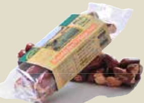
■ CASHEWS SNACKS