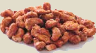
■ CANDIED CASHEWS