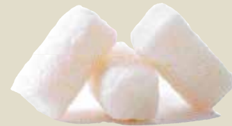
■ COCONUT SNACK-WHITE