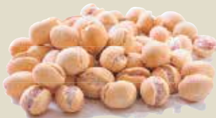
■ BOTNIMOS (KABUKIM)