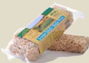
■ SESAME SNACK