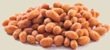
■ GRILL BOTNIMOS (GRILL-FLAVORED KABUKIM)