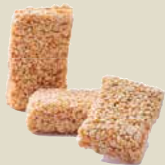
■ SESAME SNACK