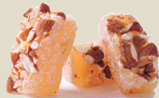
■ TURKISH DELIGHT WITH ALMONDS&PEANUTS