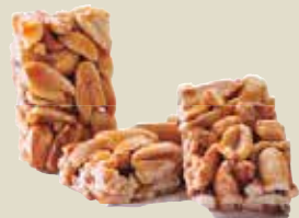
■ PEANUTS SNACK