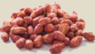
■ CANDIED PEANUTS