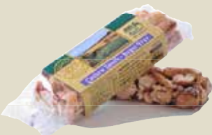
■ ALMONDS SNACKS