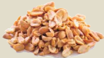
■ FRIED PEANUTS