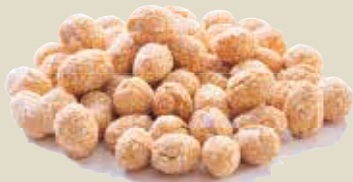
■ SESAME BOTNIMOS (SESAME KABUKIM)