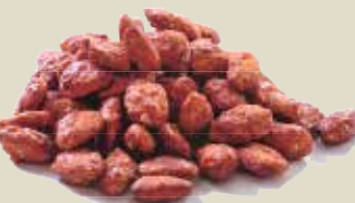
■ CANDIED ALMONDS