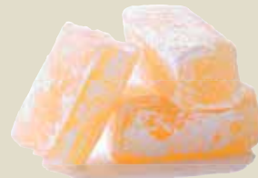
■ TURKISH DELIGHT