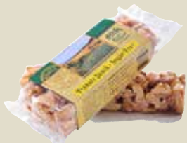
■ PEANUTS SNACKS