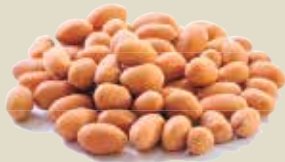
■ AMERICAN BOTNIMOS (AMERICAN KABUKIM)